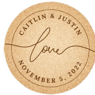
◆ Cork Coasters ◆ $2.00 Each, Minimum: 25