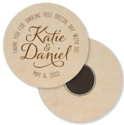
◆ 2" Wooden Magnet ◆ $1.25 Each, Minimum: 25