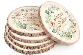
◆ Rustic Wood Slice ◆ $22 Each, Minimum: 1