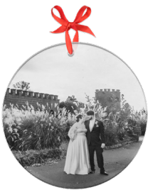
◆ 4" Acrylic Ornament ◆ $2.00 Each, Minimum: 10

Let us handle designing and printing unique items to use as guest favors, wedding party gifts, and more! Have other ideas in mind? Let us know and we may be able to help!