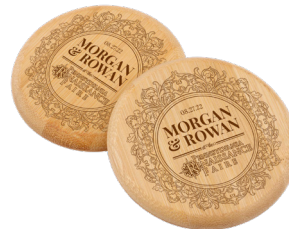
◆ Mug Topper ◆ $3.50 Each, Minimum: 10