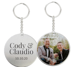
◆ 2" Keychains ◆ $2.00 Each, Minimum: 25